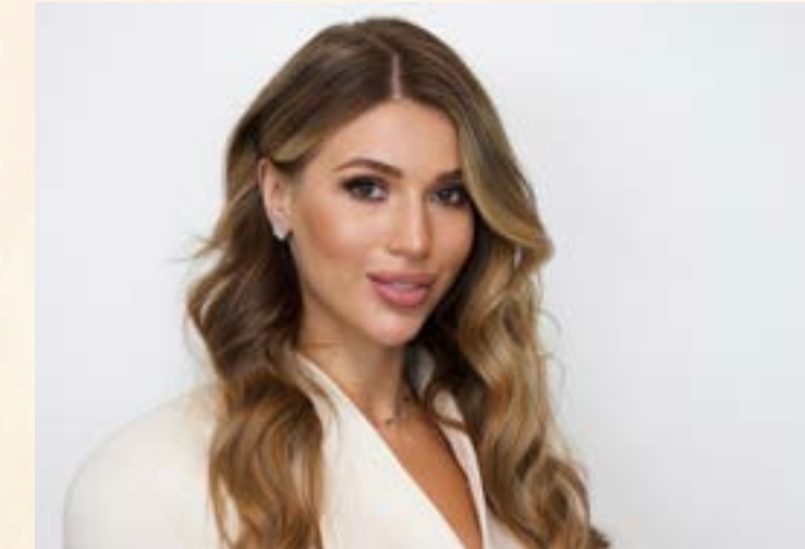
Deputy Head of the Ukrainian Part of the Ukrainian-Chinese Business Council, Director of Exclusive Concepts and Development at Epicenter K