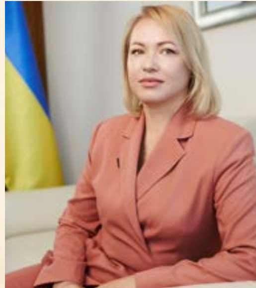
Deputy Head of the Ukrainian Part of the Ukrainian-Chinese Business Council, Member of the Supervisory Board of Silk Bridge Capital