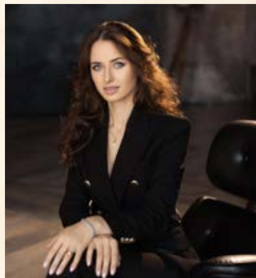
Secretary General of the Ukrainian Part of the Ukrainian-Chinese Business Council, Director of the Directorate for International Cooperation of the Ukrainian Chamber of Commerce and Industry