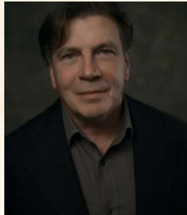
Head of the Ukrainian Part of the Ukrainian-Chinese Business Council