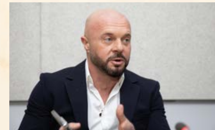
Deputy Head of the Ukrainian Part of the Ukrainian-Chinese Business Council, Founder and Chief Executive Officer of EcoDrive